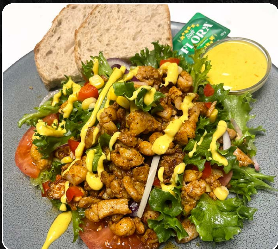
43. Warm chicken salad