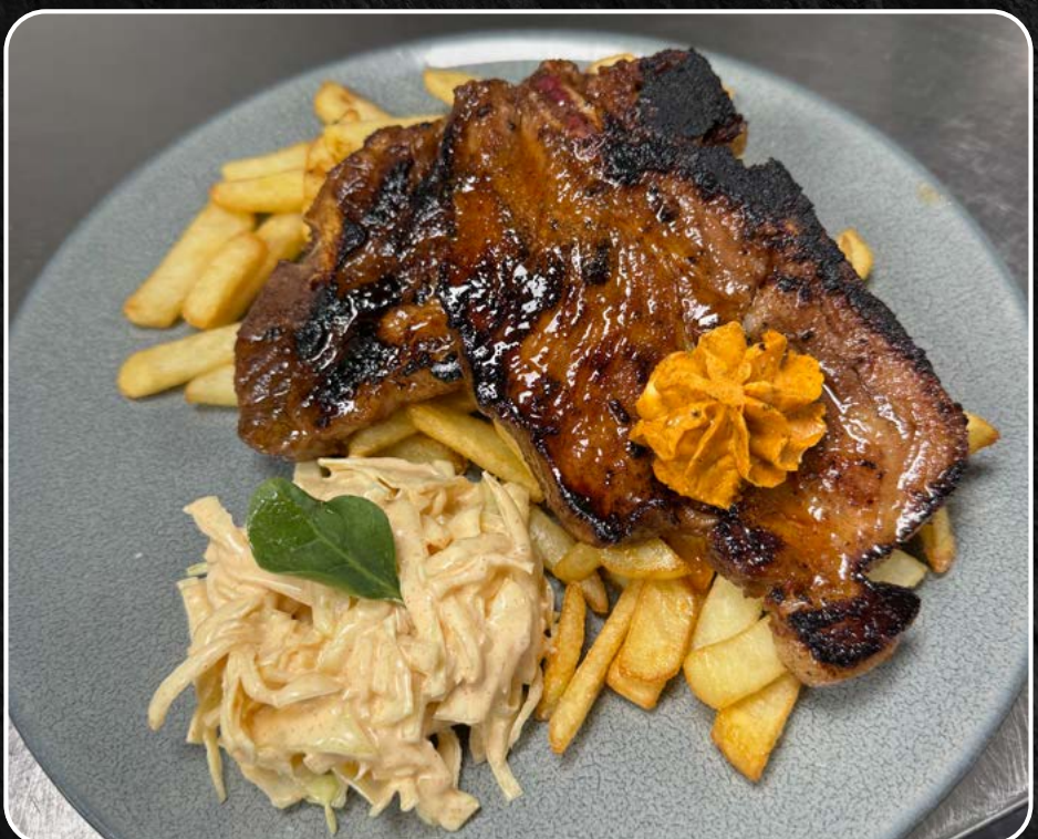
74. Marinated neck chops

Surcharge for extra creamed potato for our dishes, NOK 30.-